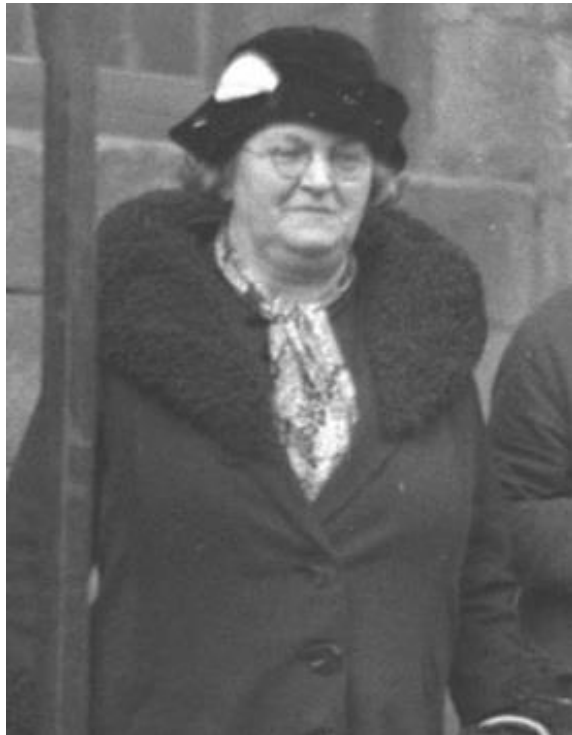
Margaret Collins-O'Driscoll, FG, first elected 1923